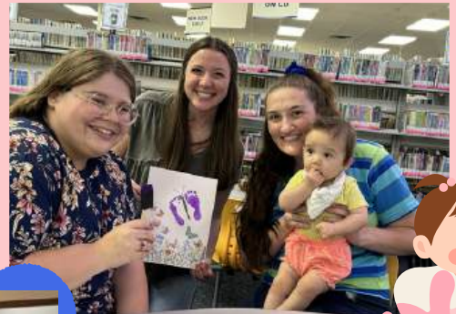
First Baby Craft success!