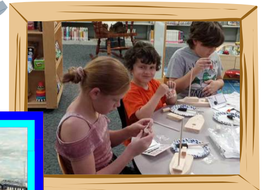
Father's Day with Home Depot!