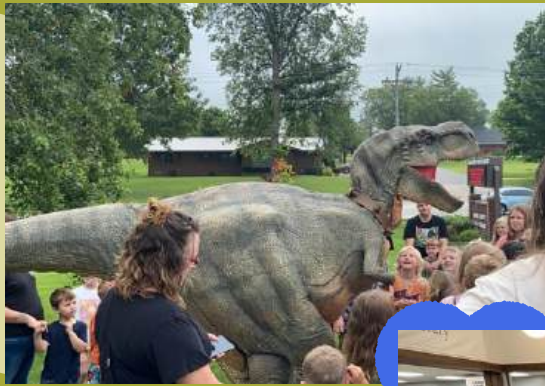
Dinos at the library!