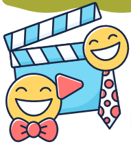
Blake was a huge hit!