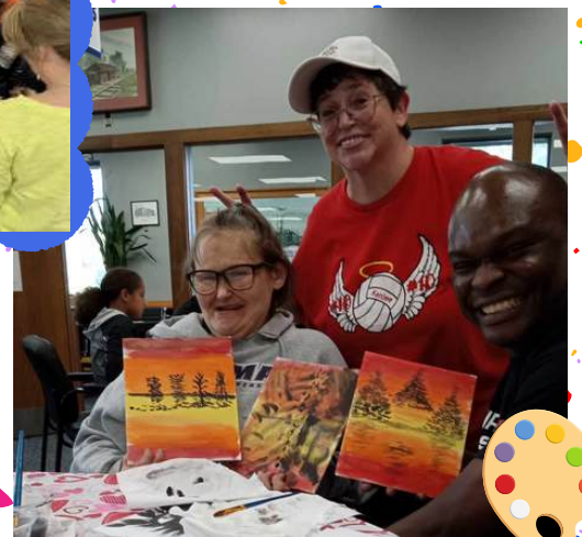
Painting with the Dockerys!

Sometimes friends are left behind and they play until they go home!